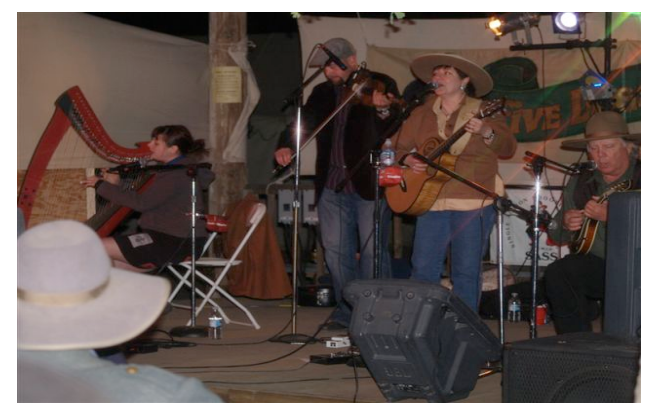
The Cowboy Celtics

The dinners Friday and Saturday evenings were catered and folks got in line early in anticipation of a great meal.