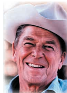
Ronald Wilson Reagan

September 30 - October 3, 2004 (12 stage main match is Fri. and Sat.) You better get signed up for this one soon as space is filling quickly!!