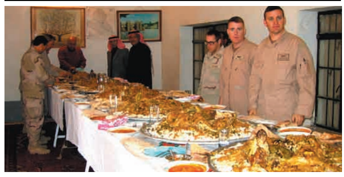
March 1, 2004

... Since you liked the sheep meal story, I've attached a photo of the spread we got. You can't see me - I'm in the back with my hand reaching into the rice (or maybe grabbing some meat). The sheikh is the old man standing at the wall in the rear. The troops on the right are some of our helicopter crews who flew us out for our visit. They had no idea what they were getting into. The Arab in black (in the back on the right side) was the one chowing down on lamb's ears. ... Regards, US Scout